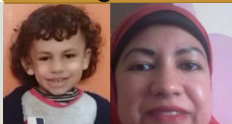
A picture of the victim and her son

The incident dates back to February 26, 2023, in the Matareya police district. The accused carried out his threat to her and waited for her to kill her. He was determined to get rid of her and their son. He tracked her movements in advance until he was sure of her whereabouts and the time of her arrival. When he saw their son with her, he stabbed her repeatedly, some of the wounds were close together and stuck in her body in front of the victim until he was sure of her death. He then carried their son and strangled him from his neck to join his mother.